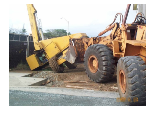
Front-end loader supports aerial lift

Atlas Insurance Agency can assist you with the development of a written program, provide management training and ensure program requirements are being followed.